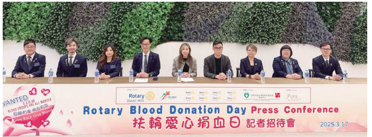
This photo shows guests attending yesterday’s press conference at NOVA Mall in Taipa.

The Rotary Blood Donation Day is slated to take place from 12 p.m. to 6 p.m. at Nova Mall on Saturday. ■