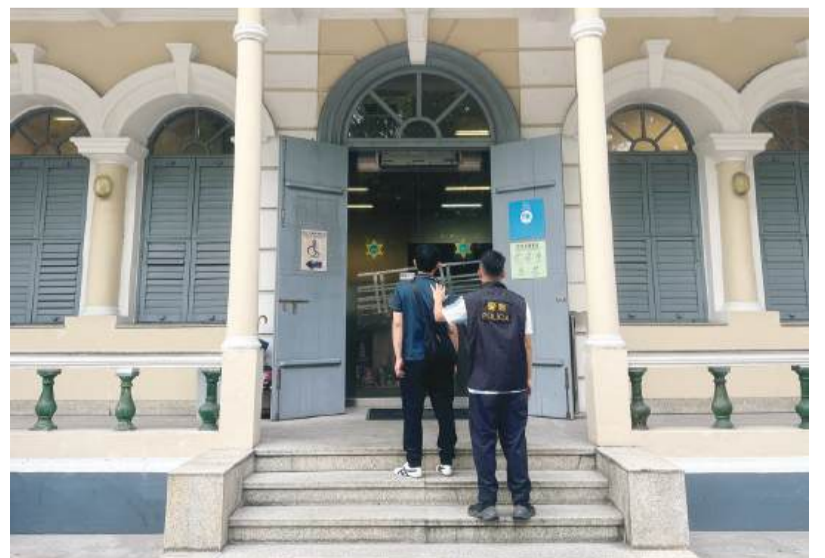
shows a PSP officer escorting the suspect into a police station.