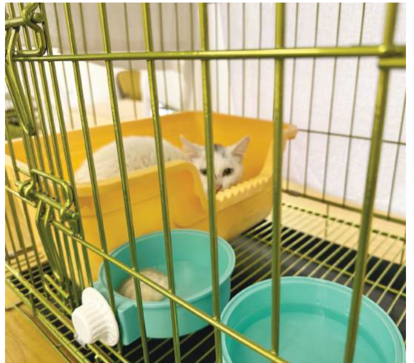
One of the 22 cats awaiting adoption sits in a cage during Sunday's campaign co-hosted by the Macau Jockey Club (MJC) and ANIMA Macau at the MJC site in Taipa.

*Feline distemper, also known as feline panleukopenia, is a highly contagious and potentially life-threatening viral disease that affects cats. It is caused by the feline parvovirus (FPV). The virus attacks rapidly dividing cells, particularly in the bone marrow, intestines, and lymphoid tissues, leading to a range of severe symptoms. – DeepSeek