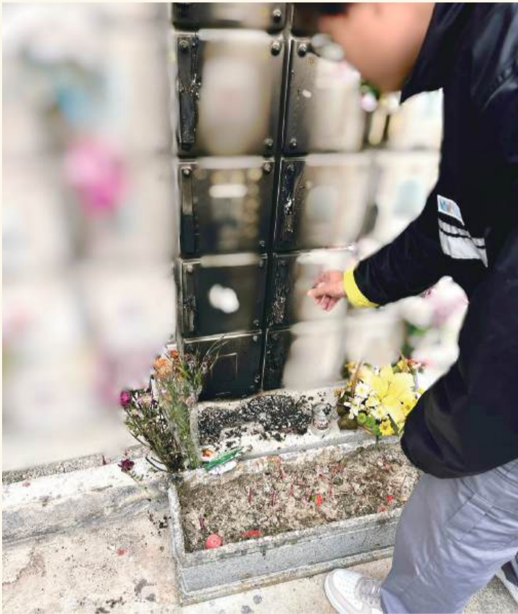
This handout photo released by the Municipal Affairs Bureau (IAM) yesterday shows an IAM inspector checking some of the columbarium niches blackened by smoke in Nossa Senhora da Piedade Cemetery yesterday.

No one was injured in the incident, the statement said, adding that the police launched an investigation into the case. ■