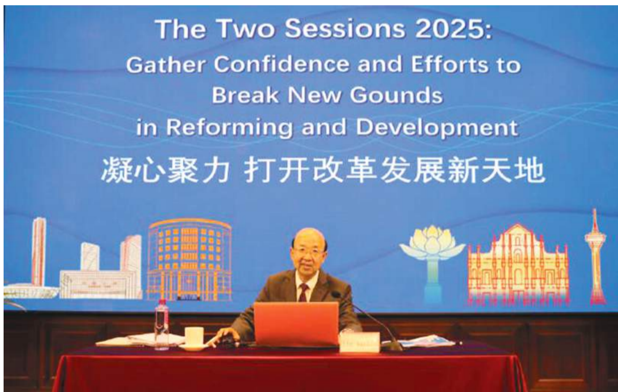
Foreign Ministry Commissioner Liu Xianfa speaks during yesterday afternoon's presentation at the Commission about the achievements of the nation's "two sessions" in Beijing.

In his 1 1/2 hour presentation at the Office of the Commissioner of the Ministry of Foreign Affairs in Zape, Liu, who holds a doctorate in management science, underlined the achievements of this year's "two sessions", detailed the nation's "whole-process people's democracy in practice", pointed out the